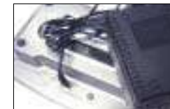
*AC Adapter (9V/1000mA)