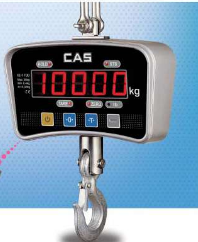
*Wireless remote controller