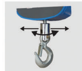
360° Swivel hook.