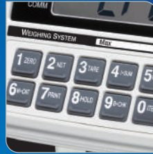
Numeric & function keys