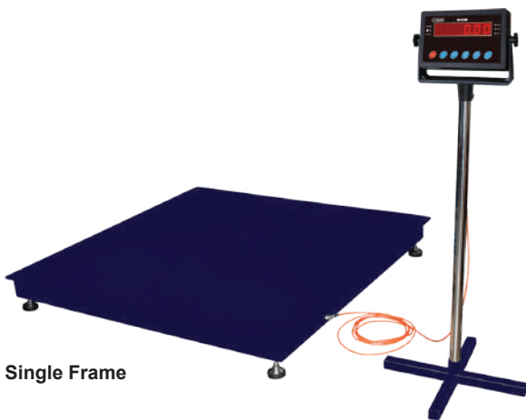
• Single Frame